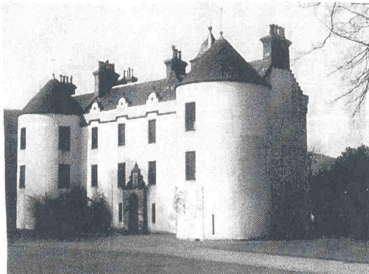
Glenbervie House 1974